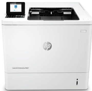
HP LaserJet Enterprise M607n

This HP LaserJet Printer with JetIntelligence combines exceptional performance and energy efficiency with professional-quality documents right when you need them—all while protecting your network from attacks with the industry's deepest security. 1