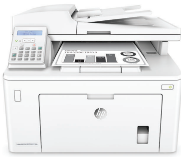
HP LaserJet Pro MFP M227fdn

Get more pages, performance, and protection from an HP LaserJet Pro MFP powered by JetIntelligence Toner cartridges. Set a faster pace for your business: Print two-sided documents, plus scan, copy, fax, and manage to help maximize efficiency.