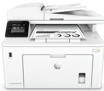
HP LaserJet Pro MFP M227fdw